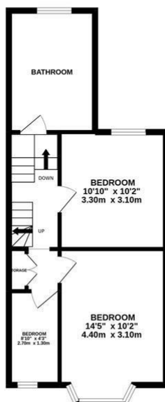
1ST FLOOR 464 sq.ft. (43.1 sq.m.) approx.